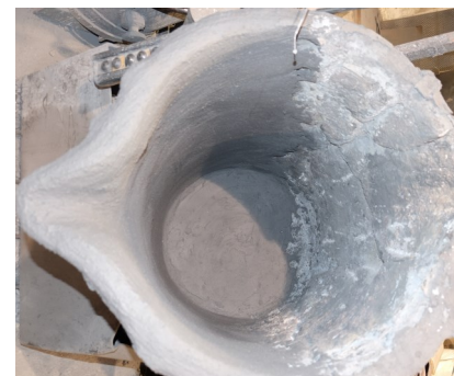
LADLE WELL coating in process