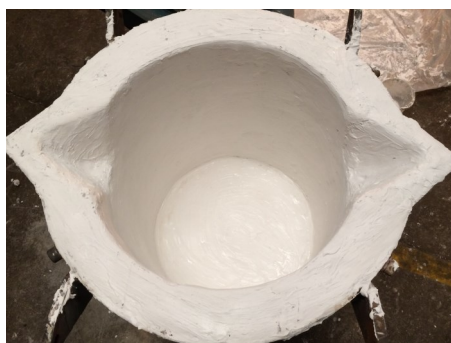
MATRIKOTE 90 AC ladle coating finished

*Product is premixed and supplied in pails